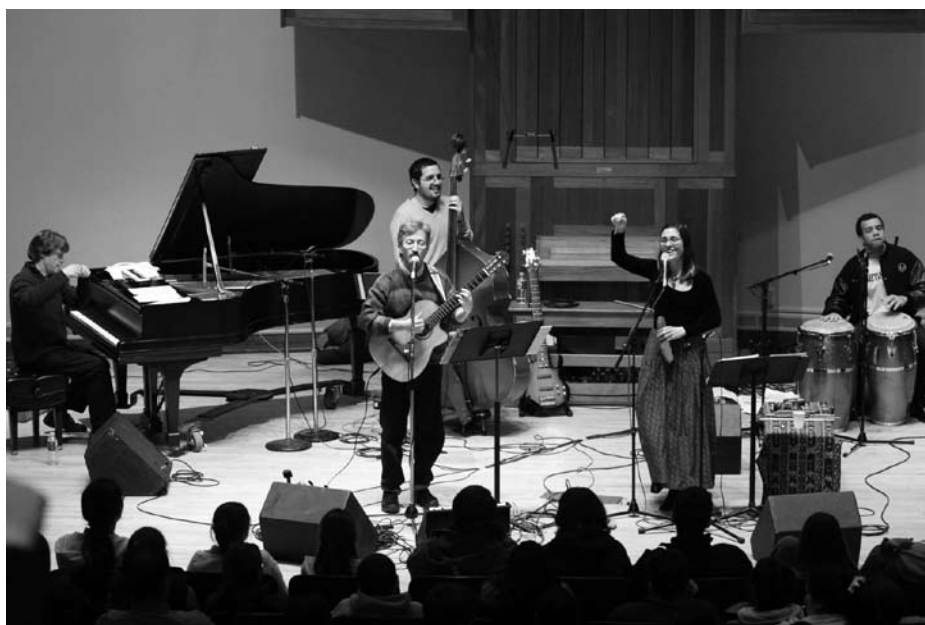
Sol y Canto performs for students in the Waltham Public Schools as part of the 2005-06 Brandeis Intercultural Residency Series.